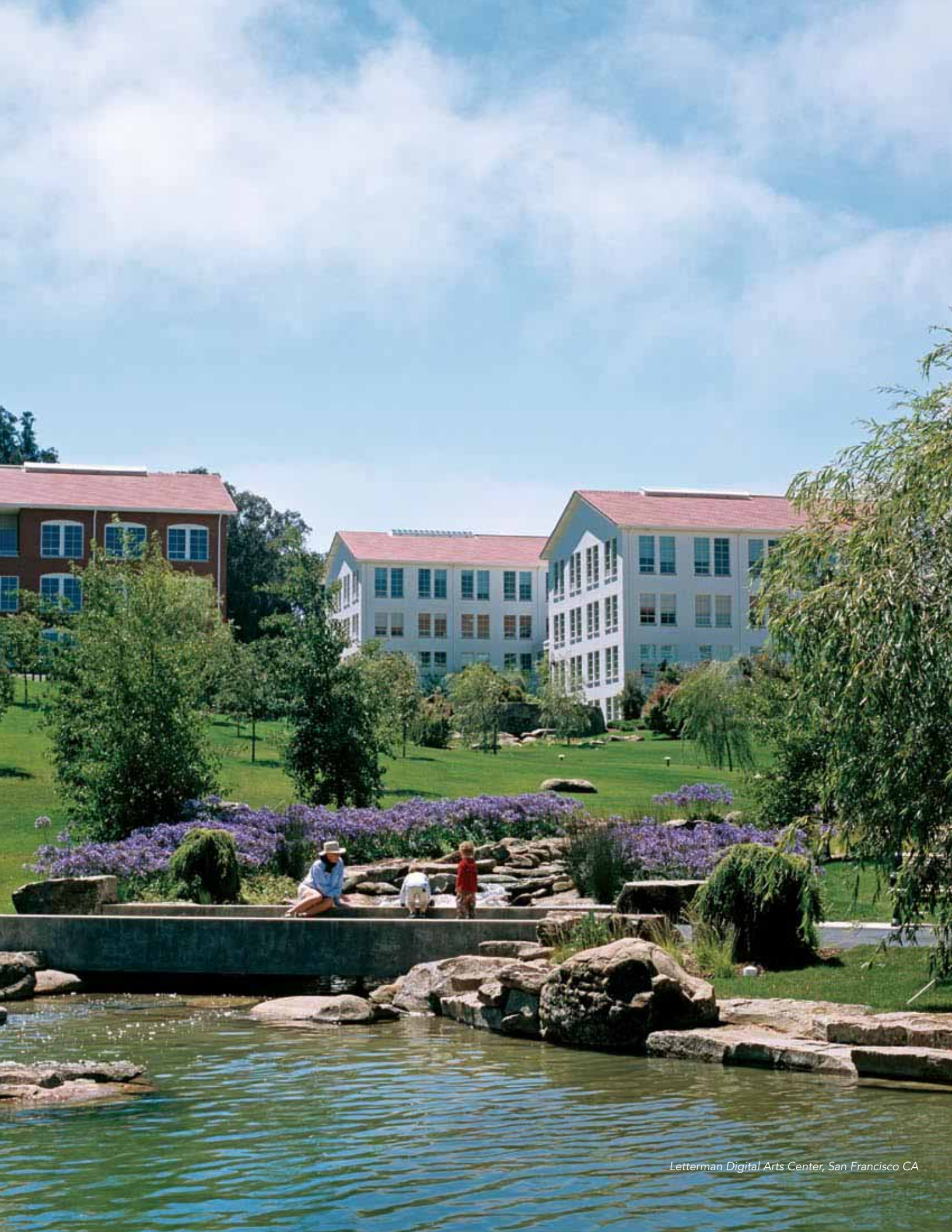
Letterman Digital Arts Center, San Francisco CA