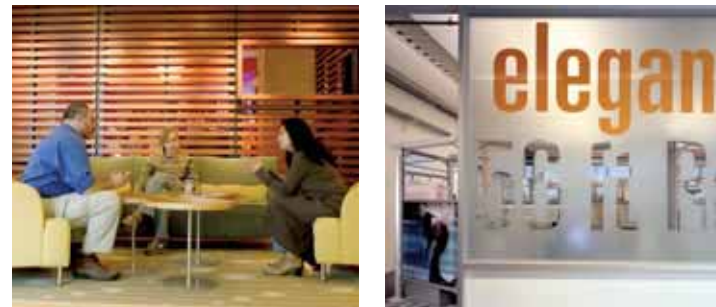
Clockwise from left: Norman Y. Mineta San Jose International Airport, San Jose CA; Discovery Communications, Silver Spring MD; Schlumberger, Houston TX; National Healthcare Organization occupancy model; Fidelity Investments collateral.