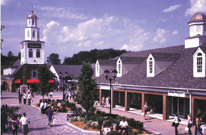
Figure 7: Woodbury Common Premium Outlets, Central Valley, New York

marketing strategies it might not pursue in its regular stores—from gifts with purchase, to lucky draws. Such outlets are new distribution channels, and opportunities to tap different, more aspirational customers. Outlets are also an opportunity to control excess inventory without sacrificing brand identity in a conventional store environment. With an outlet, brands control the pricing, hire the employees, and determine the build-out of the store. It is an orchestrated brand experiment that is executed with care, lest it tarnish the parent brand.