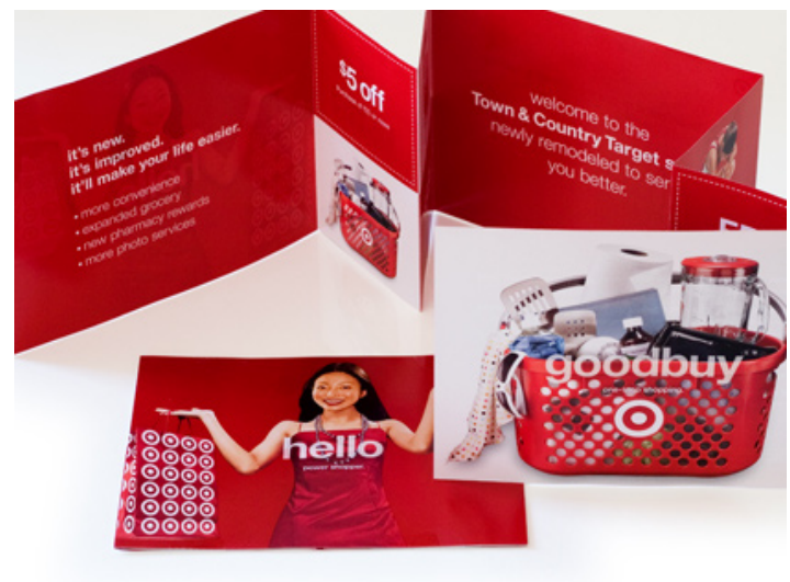
Figure 1: A direct mailer from Target’s “Hello Goodbuy” campaign

Satisfying consumer concerns is a philosophy Target Stores, Inc. has embraced, but it has recently gone to extra lengths to underscore its message. During the Golden Globe Awards, Target launched its “Hello Goodbuy” campaign to remind consumers that Target still stands for style and value (Figure 1). Target spokesperson Hadley Burrows says, “We’ve heightened our focus on our frequency-driving business including pharmacy, food and commodities, and placed greater emphasis on the Pay Less side of our brand promise—in our weekly circular, in-store signage, and through greater use of value-pricing on end-cap displays.” Target has also begun to experiment in about 100 stores with what it calls “Pharmacy TV:” television programming on health and wellness, as well as new products. It is reinforcement of Target’s value message. But, is it working? “We’re still testing it, but our store managers say that customers are watching it. We’ll be exploring this tool further,” said a Target spokesperson.