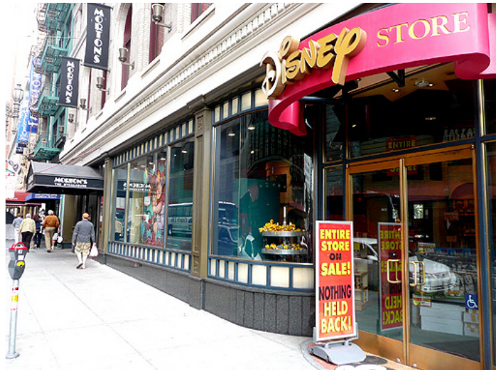
Figure 2: Disney Store, San Francisco