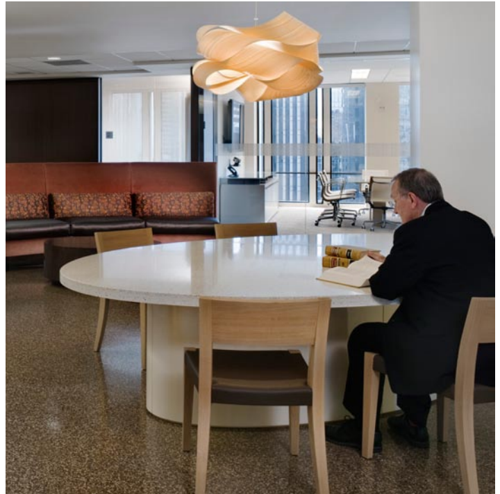
O'Melveny & Myers' community hub in its San Francisco offices

Creating multi-use and shared spaces is another way to ensure better flexibility and efficiency. Sliding walls can open a large conference room with reception to double its size for large gatherings. A library that is also a lounge, or internal conference rooms that can double as case/war rooms, help to ensure that if one use no longer becomes necessary, the construction of something new is no longer necessary. Flexibility is all about an efficient use of resources.