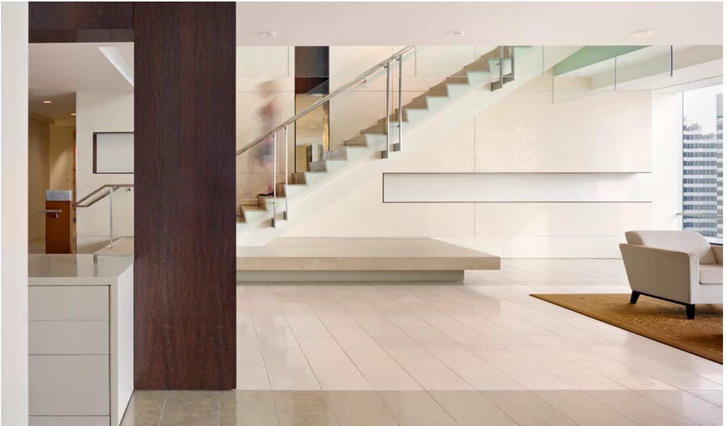
Reception area in Gibson Dunn's San Francisco offices