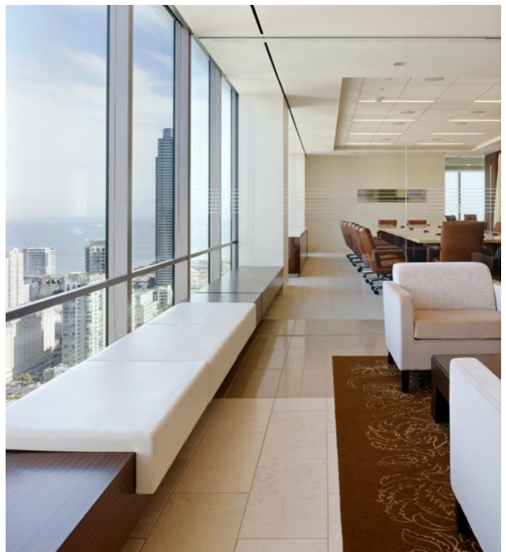
Gibson Dunn's conference room and conference reception in San Francisco