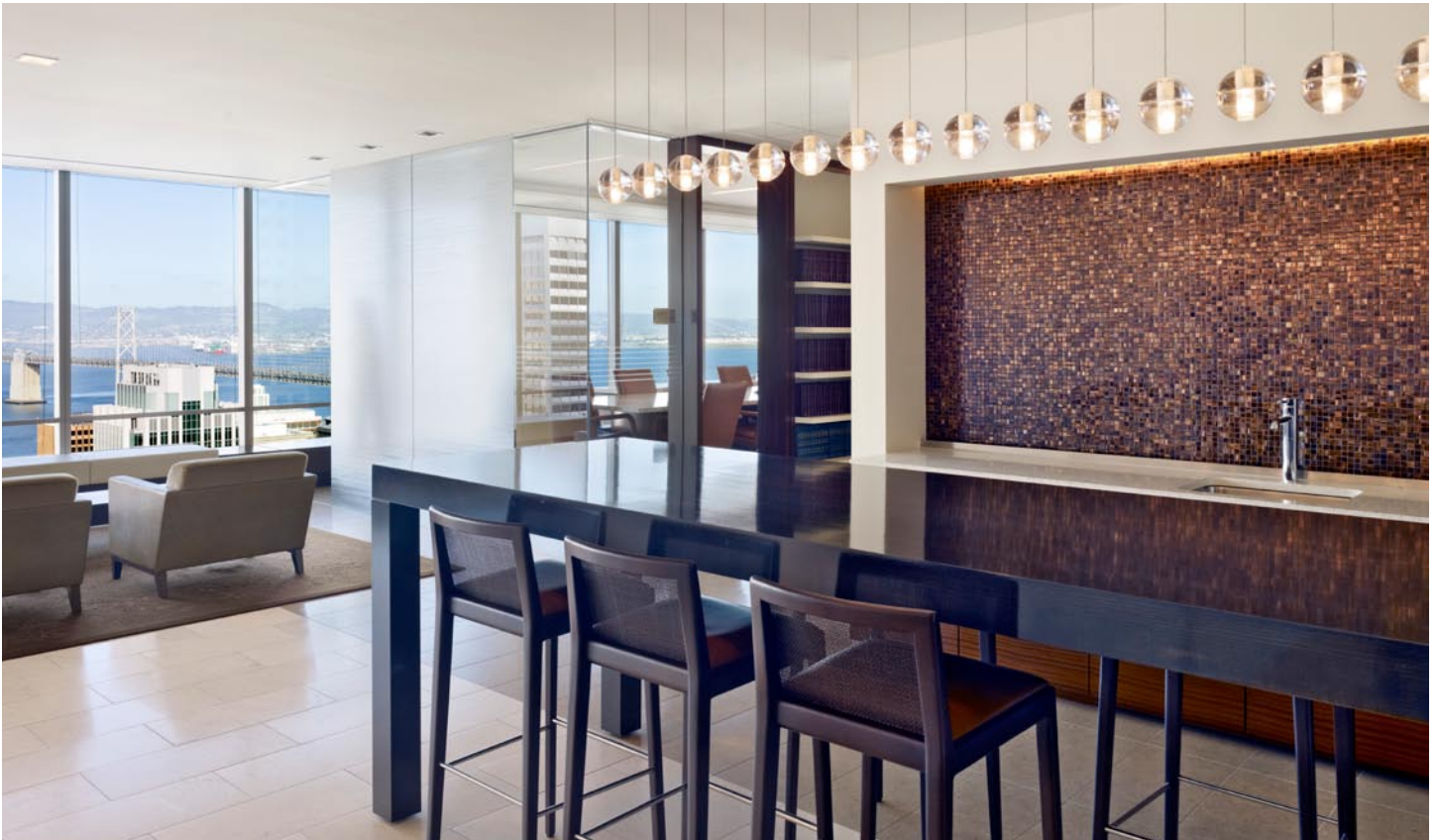
The attorney lounge at Gibson Dunn's San Francisco offices

New management metrics will be required to address these changes 7 with a shift from the traditional profit per partner, billable hours, leverage and firm rankings toward those that will better address the current issues. Profit per Employee, Client and Employee Satisfaction Ratings, Brand Strength and Return on Human Capital are some suggested by the legal management consultant Hildebrandt.