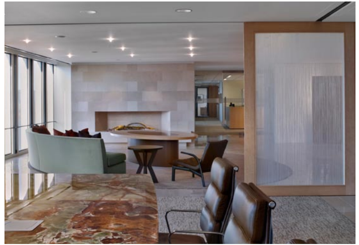
O'Melveny & Myers' San Francisco conference room and reception area

On a purely visual basis, the reduction in cost for flat screen monitors has resulted in them being able to be put into almost