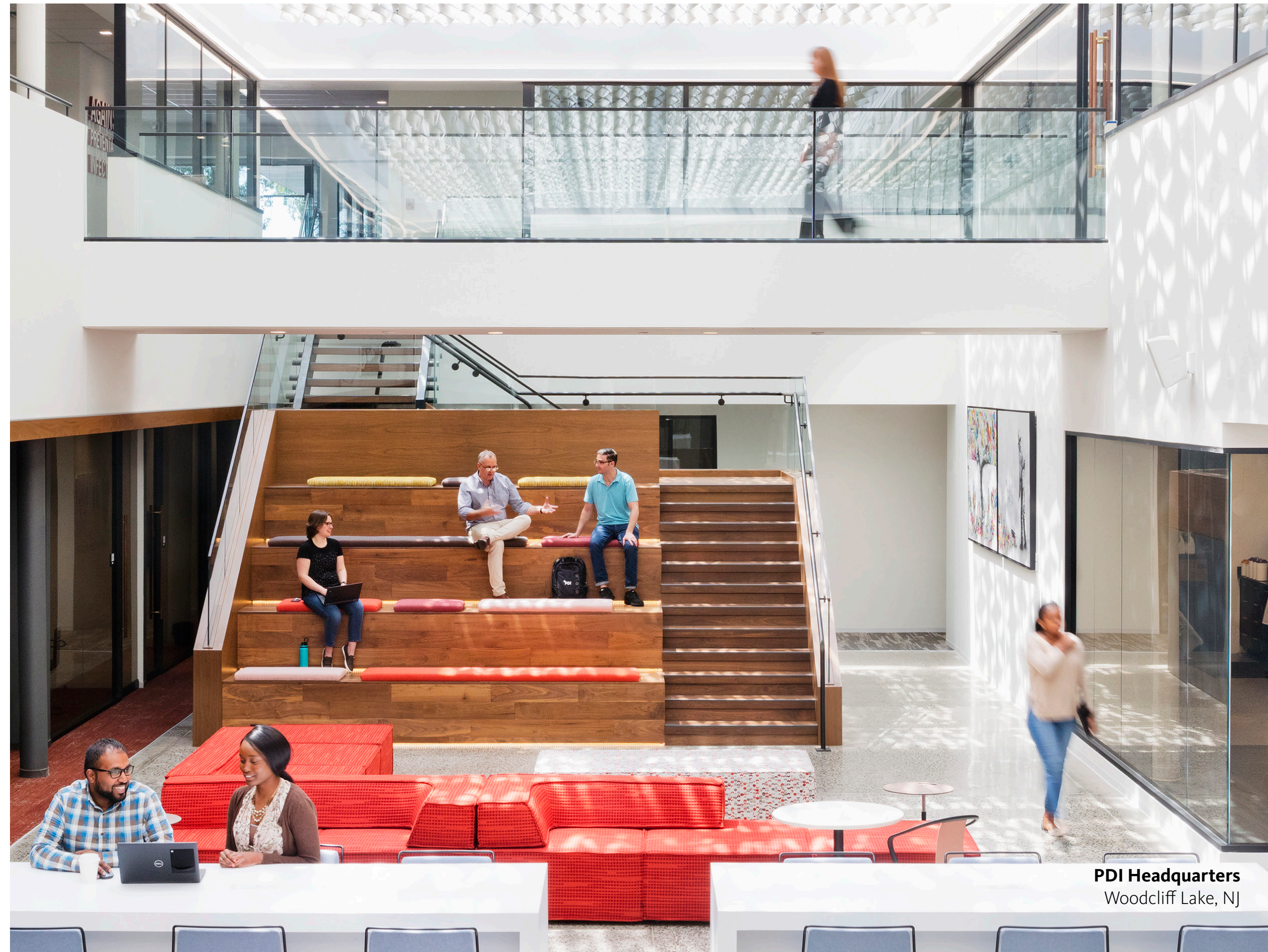
PDI Headquarters Woodcliff Lake, NJ

Winners and finalists may also be considered for a paid internship at a Gensler office, where they will be paired with a Gensler mentor who will serve as a resource during the internship and ensuing academic year.